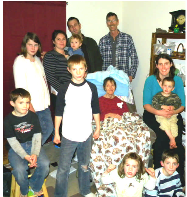
The family in Reno in January 2014