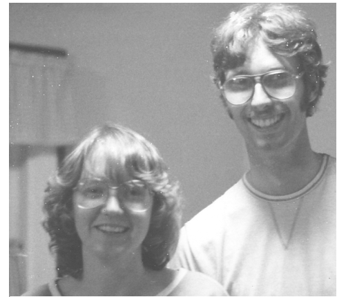
1978 just engaged