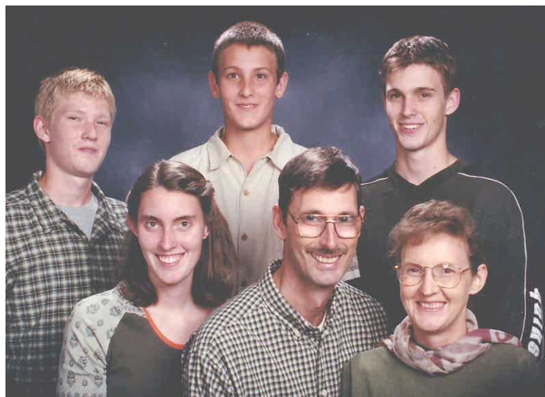
2000 furlough in Michigan